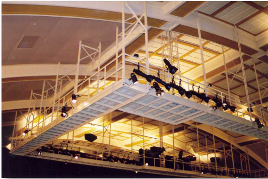
Specialty fabricated catwalks for lights and access